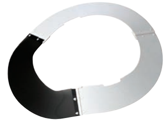
SS5 sun shield