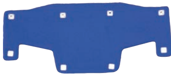
RBPCOOL brow pad